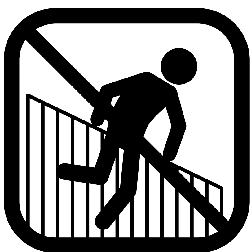
Forcing of fences

Payment of the above charges does not exclude the imposition of other penalties and prosecution.