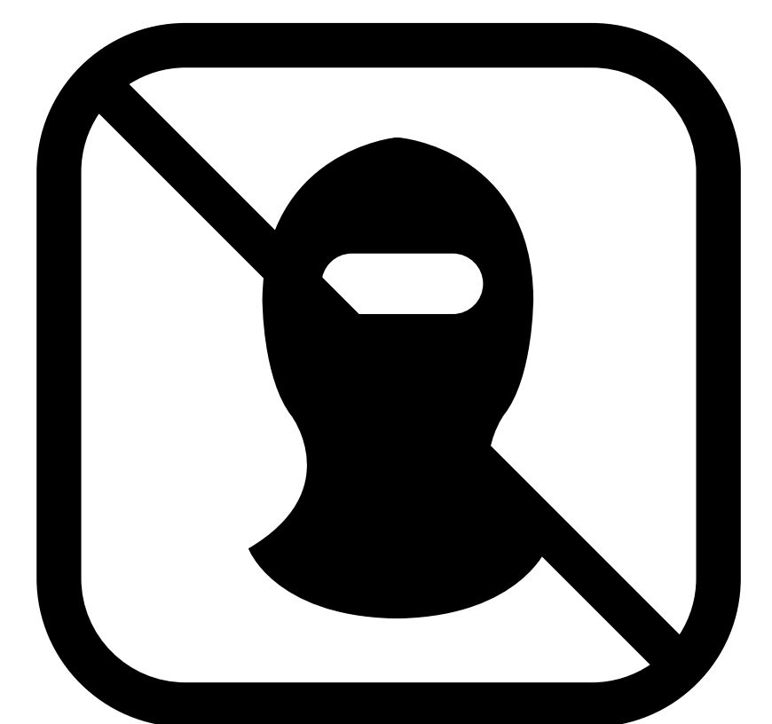
Face concealing masks