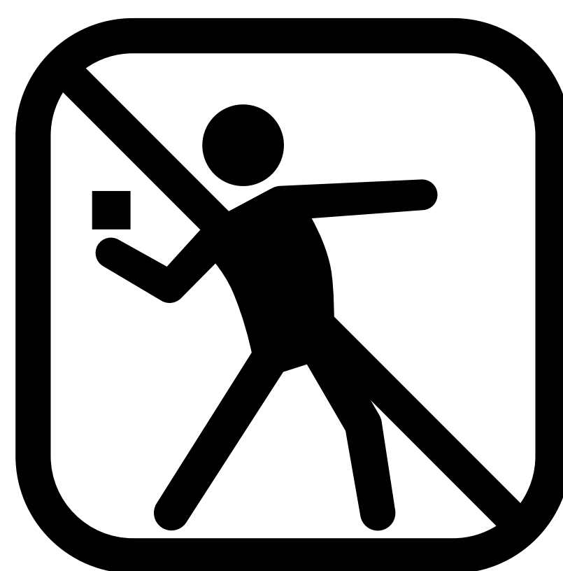
Throwing of objects