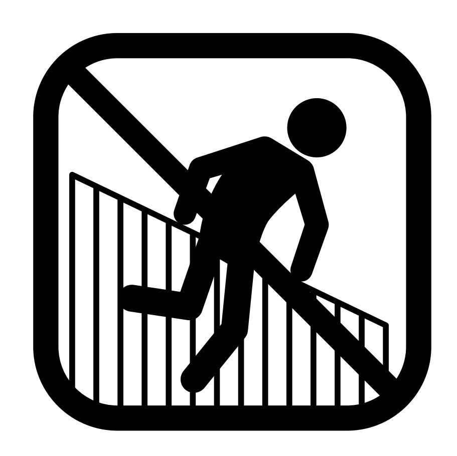
Forcing of fences

Payment of the above charges does not exclude the imposition of other penalties and prosecution.