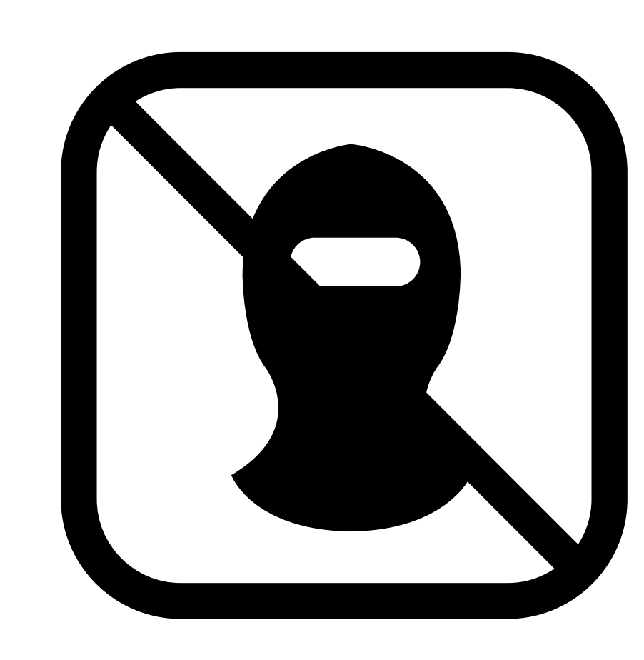
Face concealing masks