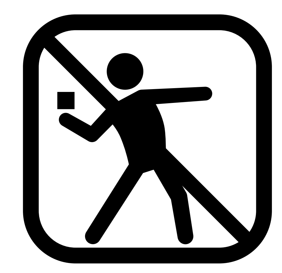
Throwing of objects